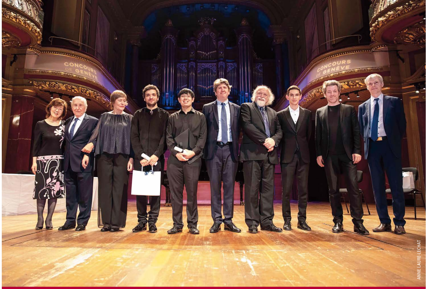
Jury and prize winners in Geneva on stage