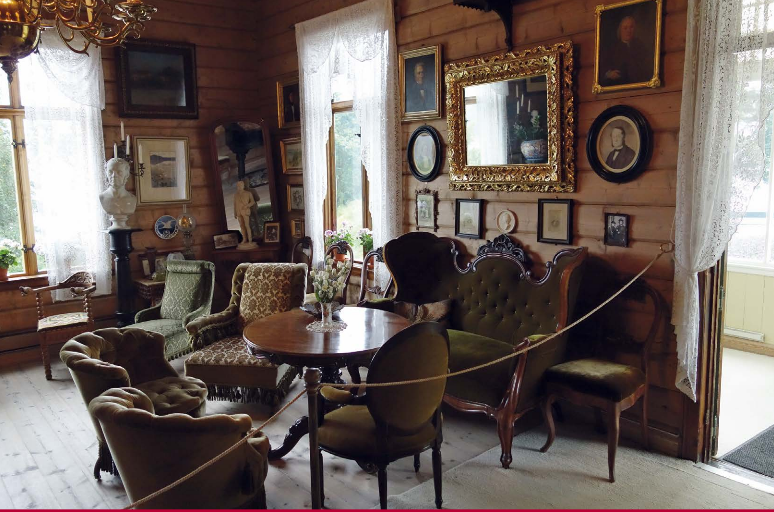
A view in one of the rooms of Edvard Grieg's home