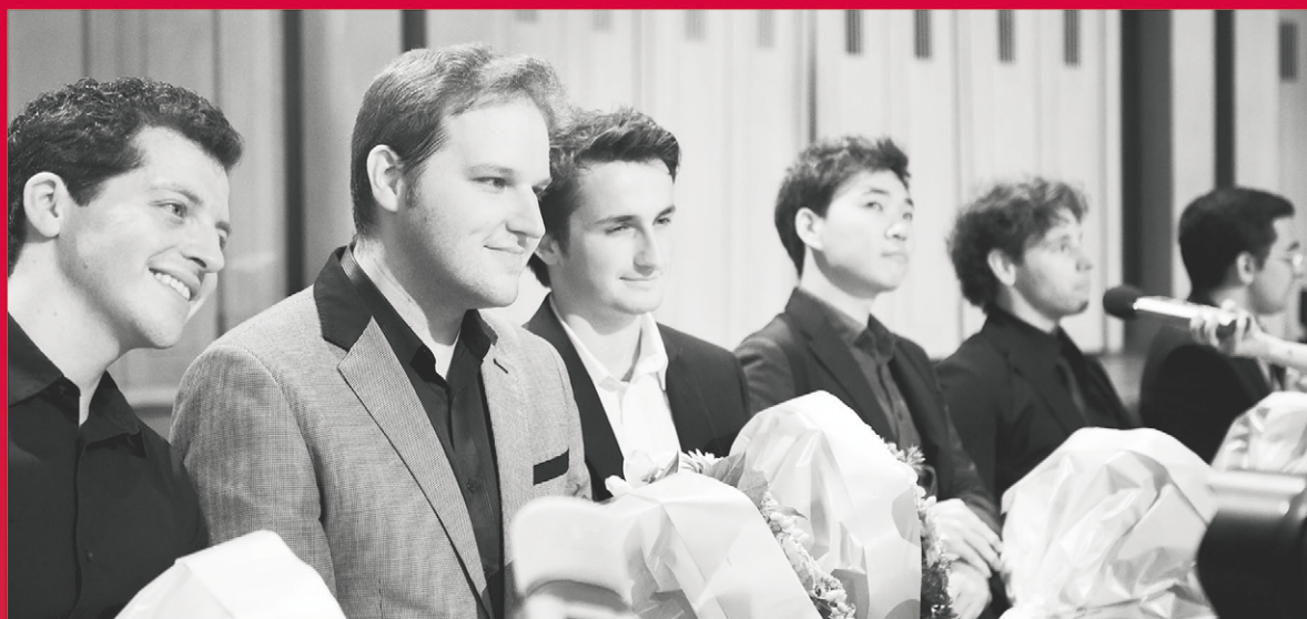
LAUREATES PIANO 2016