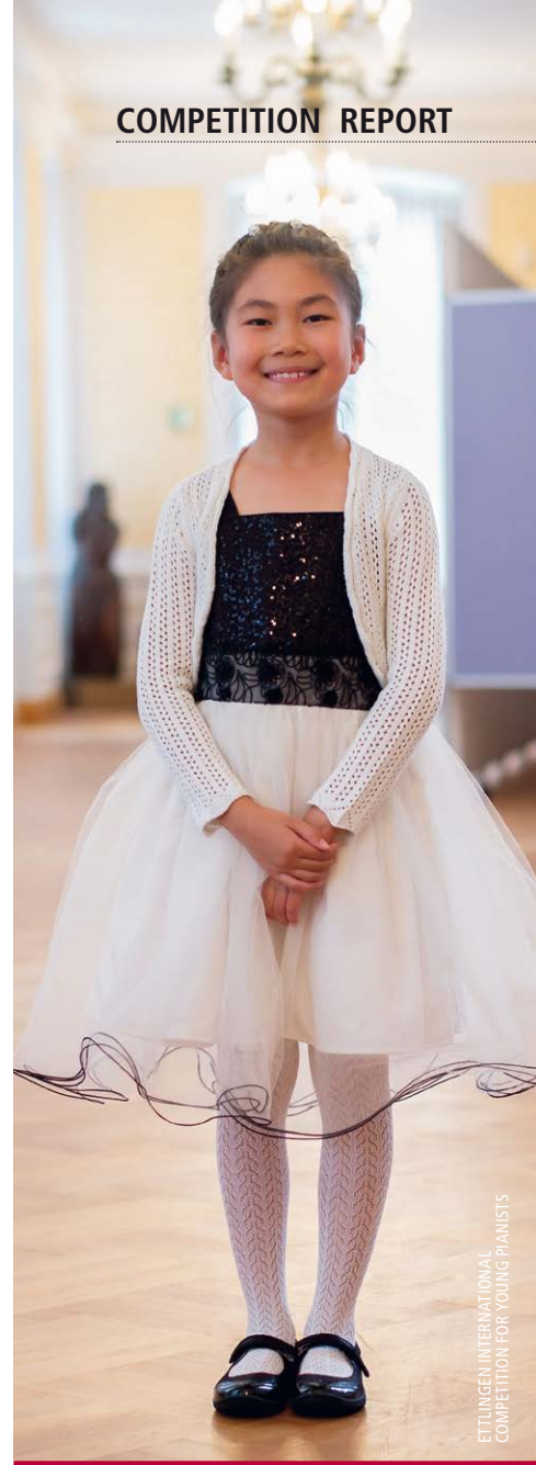
ETTINGEN INTERNATIONAL COMPETITION FOR YOUNG PIANISTS