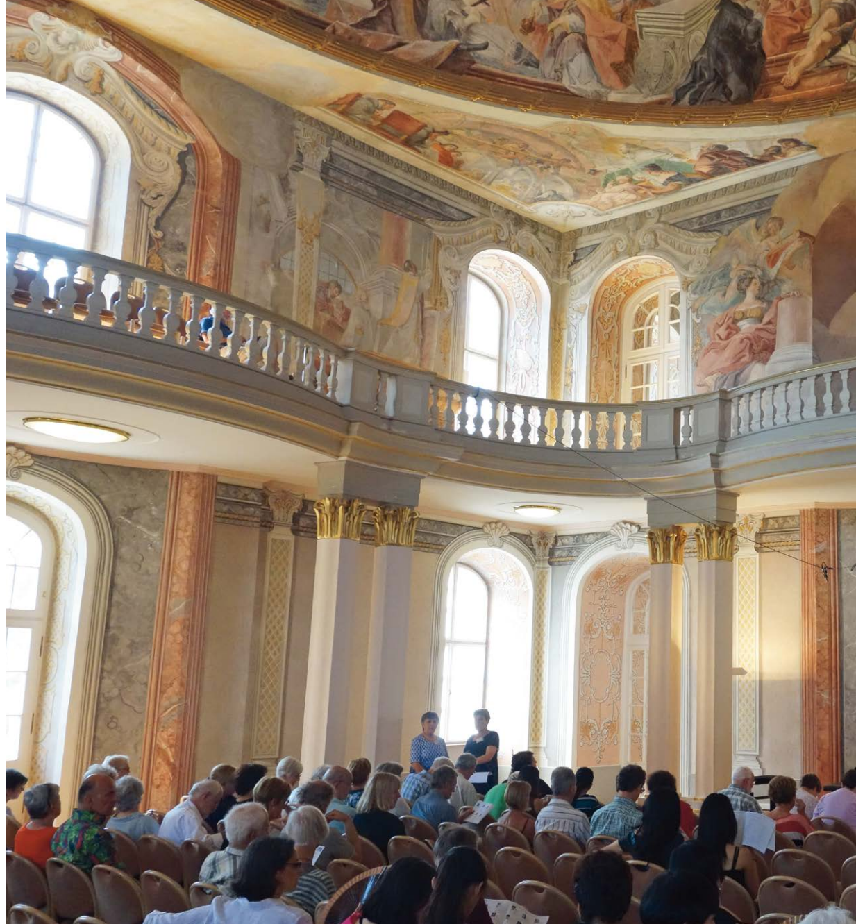
A view from the balcony in the Asam Hall.

These events were mostly open for musicians up to around 30 years old. After a while, competitions were also established that focus specifically on the much younger age groups. The prizes were not as high as those in the major competitions, but the main purpose was to offer the youngsters an international platform: to give them an exciting event, for which they need to prepare and can compare with others to see where they stand. Apart from this, it is wonderful to meet people from various countries and different cultural backgrounds, and to make friendships which are so much needed in life, especially when you are trying to make a living as a pianist.