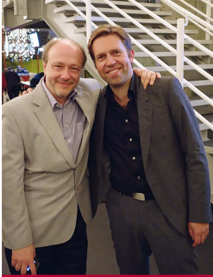
Marc-André Hamelin and Leif Ove Andsnes both served on the jury in 2012