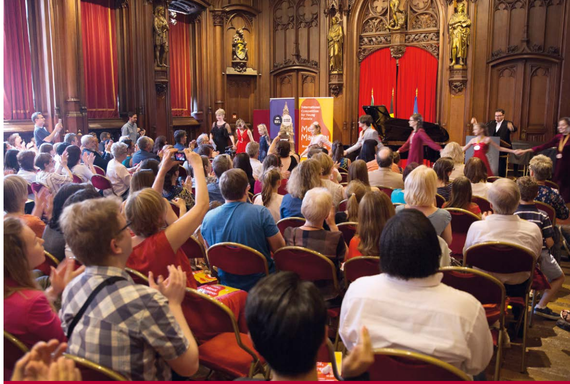
Final in the Hotel de Ville in Brussels