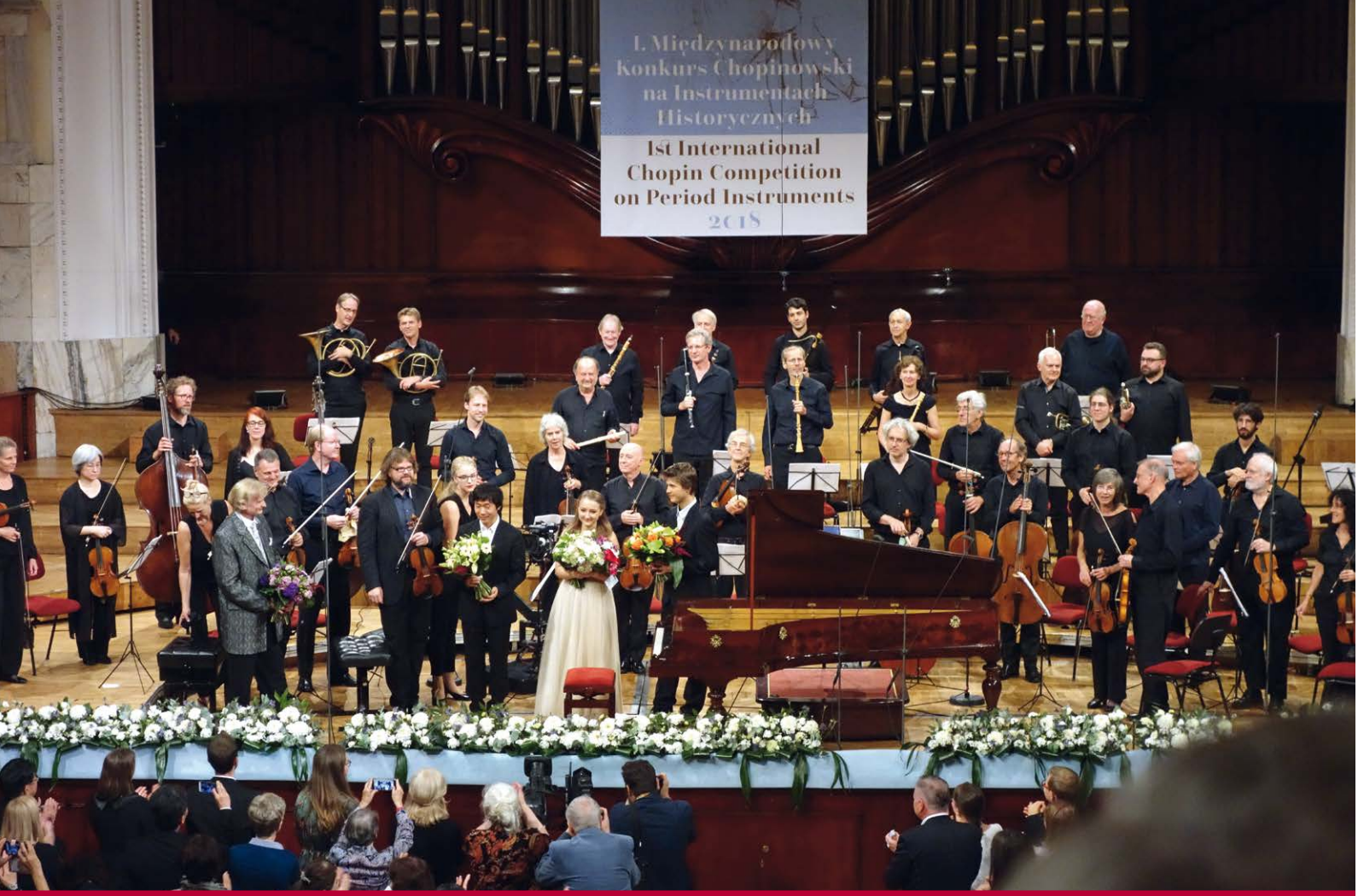
Three of the six finalists on stage after their performances on the 2 nd day of the finals