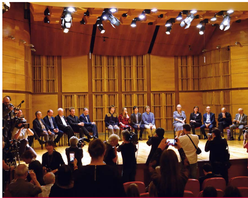
Everybody is awaiting the results. The four prize winners are seated between the 10 jury members.